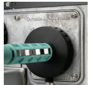
Automatic self adjustment for coated inside/outside ribbons