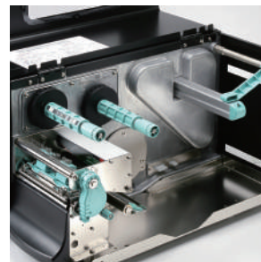
All metal, industrial enclosure and print mechanism