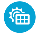
Off grid solar system